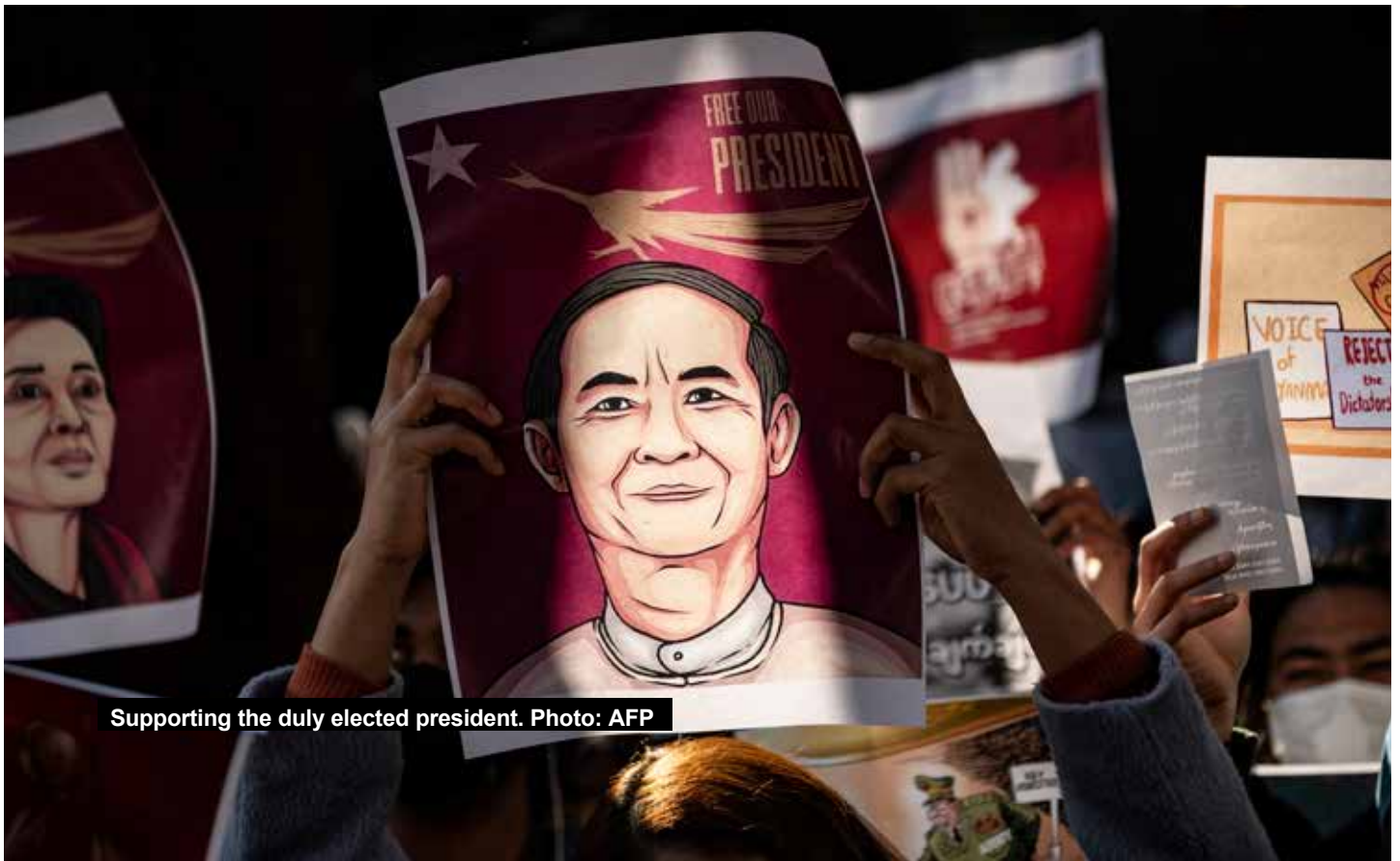
Supporting the duly elected president.