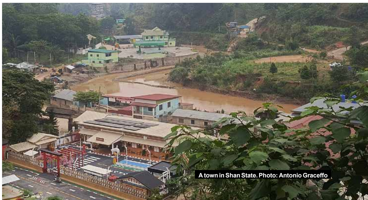
A town in Shan State.