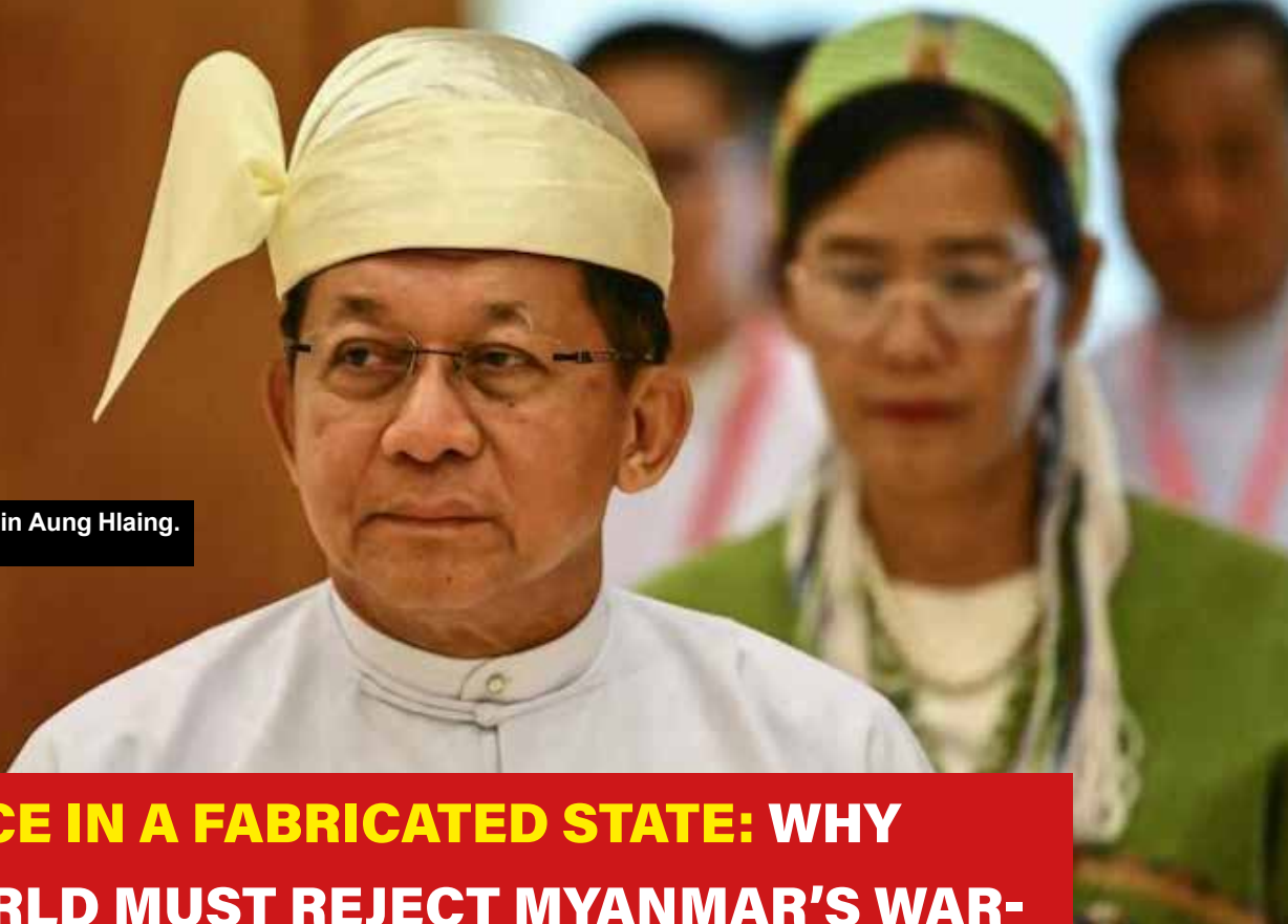
Myanmar junta leader Min Aung Hlaing.