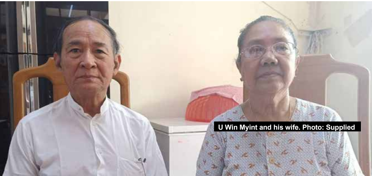
U Win Myint and his wife.