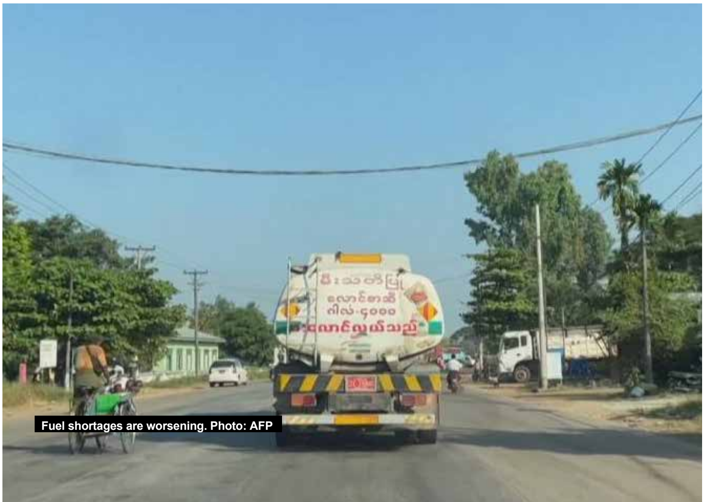
Fuel shortages are worsening.

Air power continues to play a central role in the junta's campaign. On April 23 and 24, a major airstrike operation involving six fighter jets and two Y-12 transport aircraft targeted Thandwe and Ngapali – an area once known as a major tourist destination. The strikes lasted for approximately 90 minutes across two days. Despite the scale of the assault, properties reportedly owned by families linked to senior junta