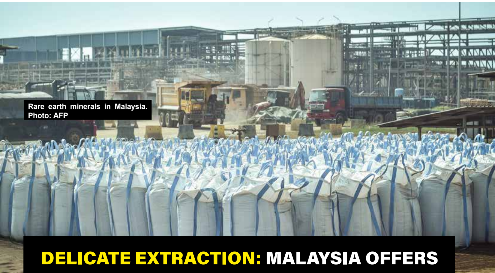
Rare earth minerals in Malaysia.