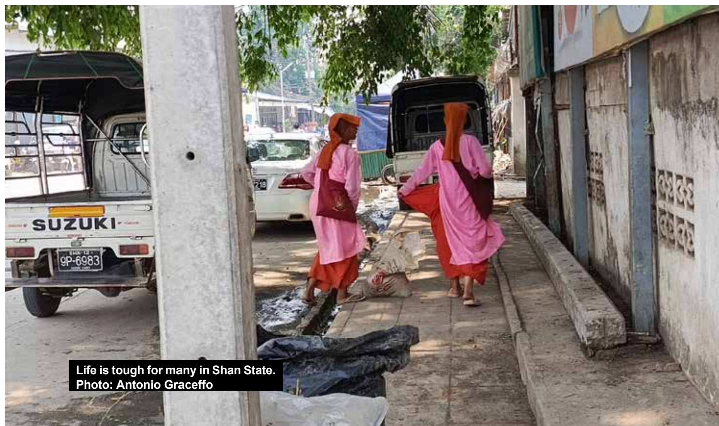
Life is tough for many in Shan State.

The education system under the junta has deteriorated. In resistance-controlled areas, schools are often targeted by airstrikes, leaving many villages without a proper school building. Teacher shortages are acute, and many teachers have fled the country. Those who remain often neglect their classroom teaching duties, prioritizing instead private tuition in homes as a means of supplementing their incomes. Schools have increasingly engaged in corruption, charging higher fees under the guise of hidden educational costs. Parents who have the option, like Sai Keng Kham, send their children to school in Thailand. Other families rely more