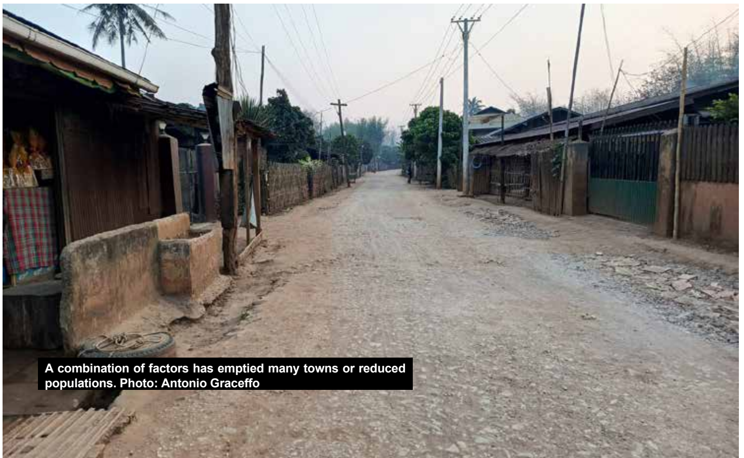
A combination of factors has emptied many towns or reduced populations.

The claim of multiple checkpoints per township, each demanding payment, is corroborated by international observers. The International Crisis Group documented that on a 45-minute drive between two northern Shan towns, travelers must pay fees at four separate checkpoints controlled by different armed groups. The same report went on to say that armed groups also levy annual contributions on communities, vehicle registration taxes, and taxes on businesses. When transporting goods, including his agricultural produce, he must pay fees at these checkpoints. As a result, these additional costs often leave him with little to no profit.