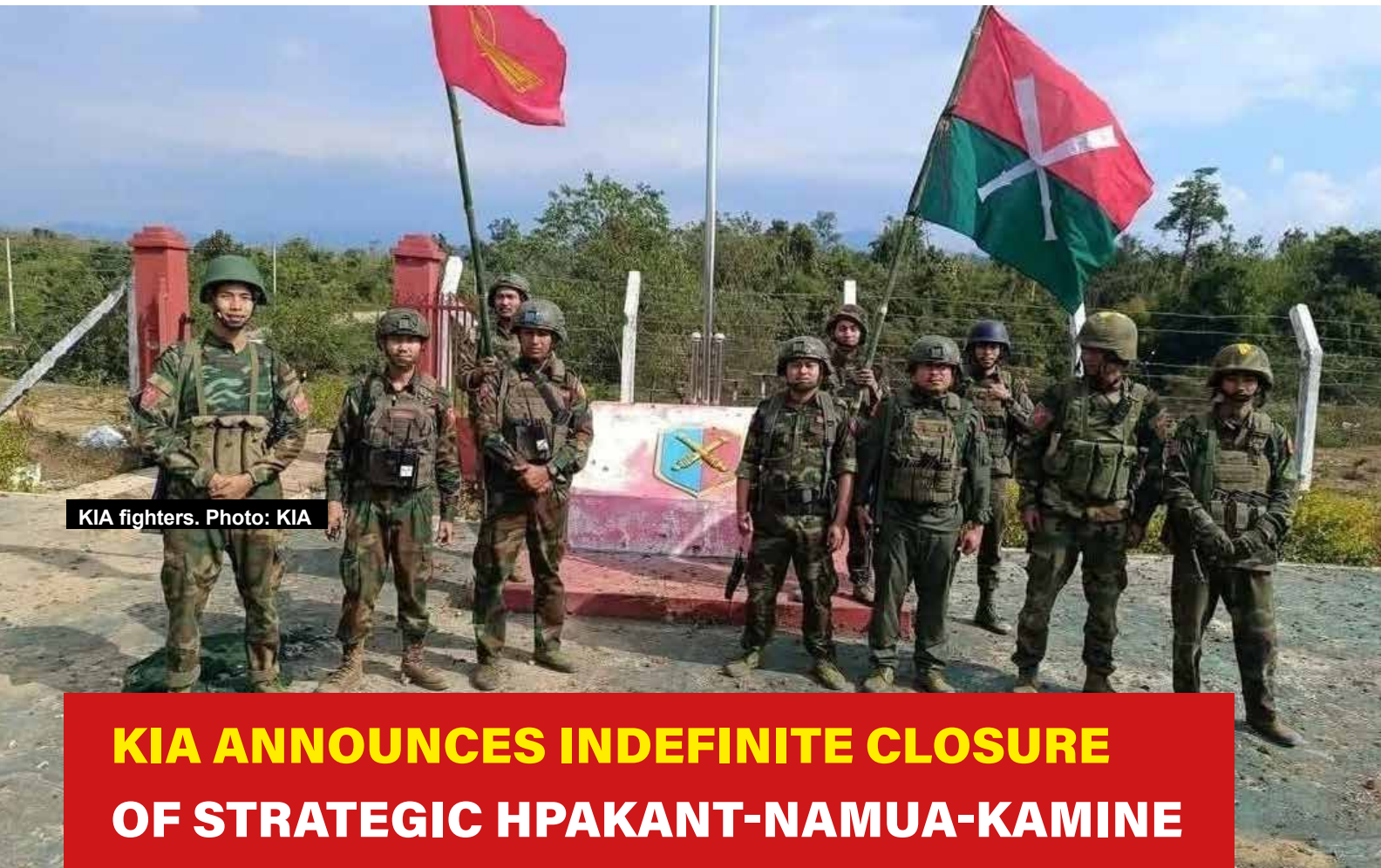
KIA fighters.